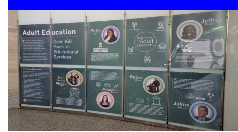
Adult Education Display at the California Education Department Lobby, Sacramento

plan initiatives, i.e., the Los Angeles Regional Adult Education Consortium (LARAEC) Regional Plan, LAUSD Strategic Plan, and Division of Instruction Strategic Plan, all of which emphasize college and career readiness for learners.